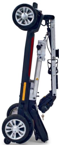
Convenient kickstand for small space storage!

Thank you, Golden Technologies, for giving me my life back!”