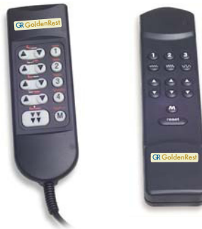
HAND CONTROL WIRELESS REMOTE UPGRADE

Featuring the ultimate in style and comfort. Available in all sizes, this luxury adjustable bed features independent foot and head operation controlled by a single, low voltage, whisper quiet electric motor. Enjoy our state-of-the-art dual motor WAVE motion massage system offering up to 3 different wave selections and infinite wave intensity adjustments. This adjustable bed offers more options, with more settings and the most positions all controlled with a new easy to operate hand control. More standard features include heavy-duty casters, backboard brackets, and wood trim skirting.